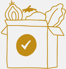
FOOD SAFETY CERTIFICATION P. 60