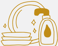
ENHANCED RESTAURANT PROCEDURES P. 59