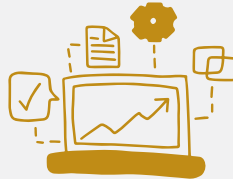
ADVANCED TECHNOLOGY P. 58