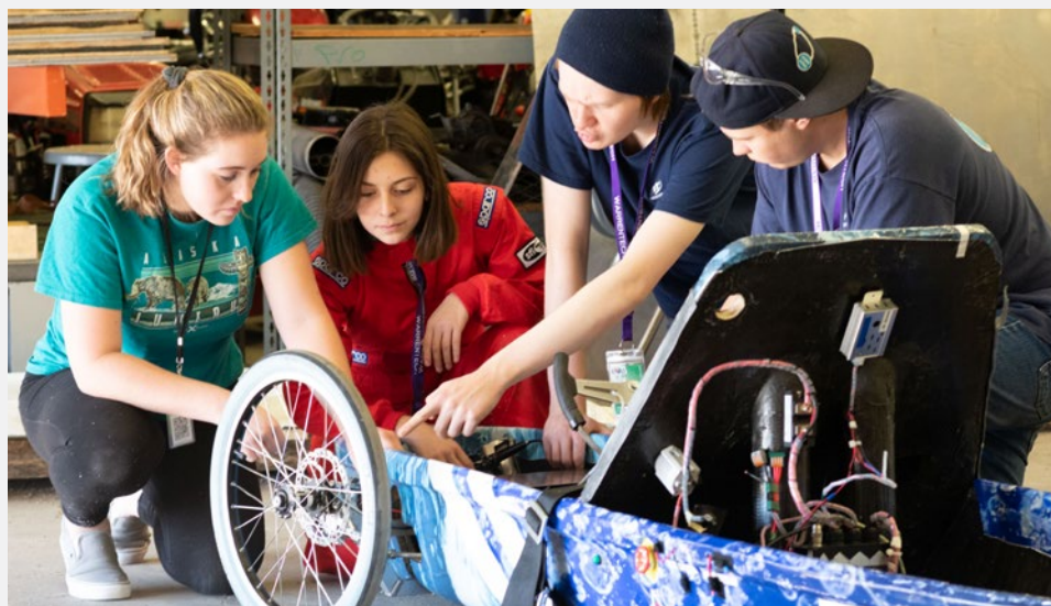
Chipotle fundraiser with Warren Tech School helps students buy parts to build hydrogen-powered race car

Chipotle's local support extended to frontline workers. In 2020, we donated 200,000 burritos to