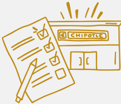
RESTAURANT INSPECTIONS P. 61