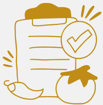
SUPPLIER INTERVENTION P. 56