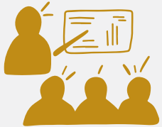
ADVISORY COUNCIL P. 63