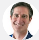
Brian Niccol Chairman and Chief Executive Officer