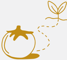
INGREDIENT TRACEABILITY P. 62