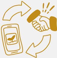
FARMER SUPPORT & TRAINING P. 57