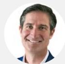
Brian Niccol Director since 2018 Chief Executive Officer and Executive Chairman, Chipotle Mexican Grill